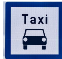
Taxi from the airport to Monaco 90€