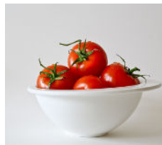
A kilo of tomatoes 3,90€