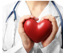
Specialist appointment 60€