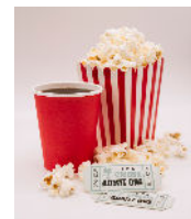
Cinema ticket 17€