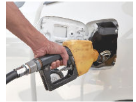
A liter of petrol 1,90€