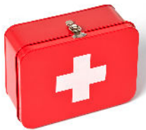
Doctor's appointment 34€